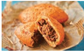
BIWAKO TERRACE Curry Bread