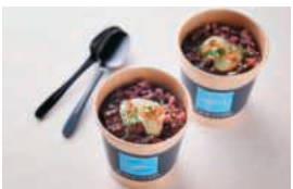
Biwako Black Curry