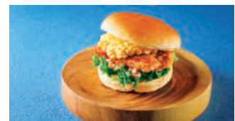
Fried Chicken Sandwich