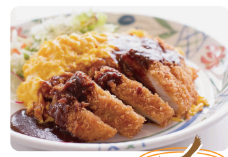
Bird Castle Bird Castle

220 seats Casual restaurant in the ropeway summit station. Udon with simmered beef 950 yen