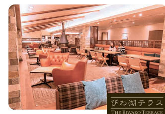
Biwako Terrace Café THE BIWAKO TERRACE

240 seats Café-restaurant in the middle of the ski hill. Premium Pork Outlet with Boruga rice 1,200 yen