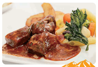
Lake View Lake View

Four restaurants at the top of the mountain with a stunning view!